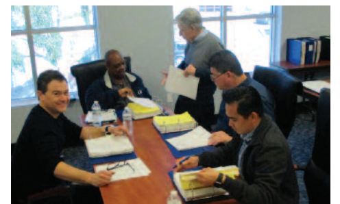
Bargaining Units 501-502