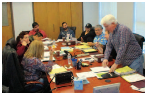
Bargaining Units 131-132