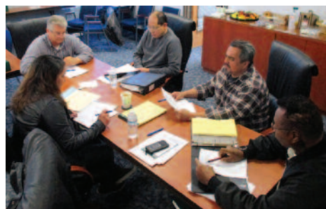
Bargaining Units 511-512

Please check the CAPE website for updates at www.capeunion.org/negotiations18 . We will also send member updates on the negotiations to their home email addresses as the talks progress. Please make sure your home email address is updated in our database. CAPE has also established an email for negotiations, should you want to send information, 2018negotiations@capeunion.org . ■